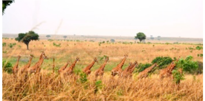
Figure 3: Photo d'un des troupeaux de girafes dans