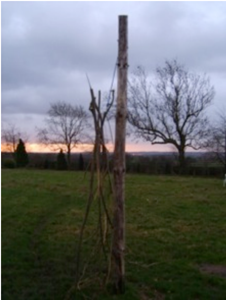
Plate 1: Browse pole constructed for Mhorr gazelle at Twycross Zoo (Roffe, 2006).

Mhorr gazelle feed on Acacia scrub in the wild (Abaigar et al. , 1997); in order to encourage natural browsing behaviour in the gazelle they were provided with a tall pole where browse was hung (see plate 1). A length of ‘bungee’ rope was used to hang browse inside the gazelle’s house, providing a challenging feeding station to keep the animal’s occupied (see plate 2). Mhorr gazelle will feed bipedally (Thuesen, 2007) and hence these two devices allow the animals to express foraging behaviours akin to those used in the wild.