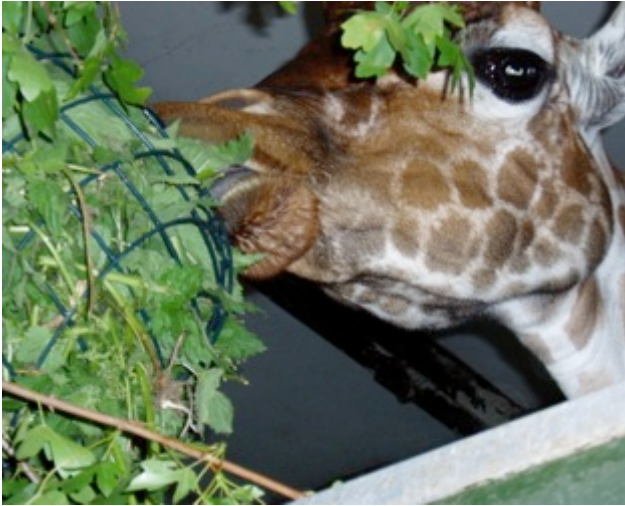
Plate 3: Browse ball containing stinging nettles used for giraffe enrichment at Twycross Zoo (Rose, 2006).

case in point being the use of stinging nettles ( Urtica dioica ) as enrichment for the giraffe; providing the animals with nutrition as well as sensory stimuli and also occupying their time when placed inside a browse ball (see plate 3).