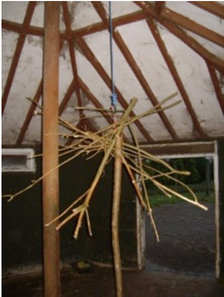
Plate 2: Browse suspended on a ‘bungee’ rope in indoor housing for Mhorr gazelle at Twycross Zoo (Roffe, 2007).

Cassinello et al. (2000) studied four groups of all-male dama gazelle and noted that there was a significant relationship between enclosure size and level of aggression. Observations of the gazelle at Twycross noted a strict social hierarchy between individuals and the smallest individual being subject to the highest level of aggressive responses (Roffe, 2006). Dissipation of aggression in the gazelle is achieved by the placement of lattice fence panels at strategic points throughout the paddock. ‘Planting’ of browse around the enclosure helped to reduce dominance-related aggression over particular resources, whilst also providing extra cover for the animals.